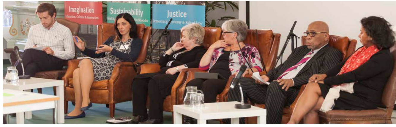
Members of the European Access Network present their work to the Salzburg Global Fellows