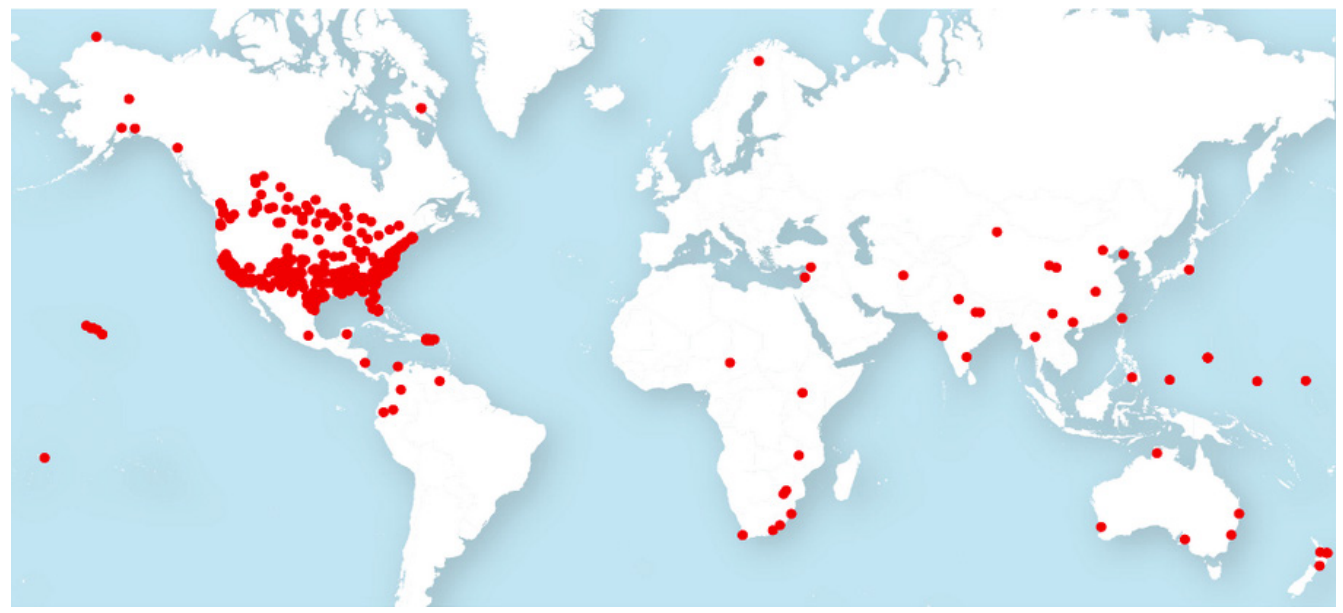
Colleges and universities that serve "students at the margins" either by mission or by demographic. Research by the Penn Center for Minority Serving Institutions

designations are more established than others. There are those that are self-made while in other contexts, identification is discouraged due to past injustices. Participants agreed that, although precarious and at times rigged with stigma, when used strategically, identity can ensure programs have maximum impact. Therefore, identities should be additive, counteracting any disadvantage students already face. However, for general use, students should be the prime agents in defining and validating what it means for them.